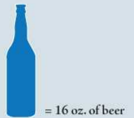
fig 1. Meat Adding beer to meat products increases the 'yum' factor by 20%.

The reason why men drink beer is simple math. Adding beer to any equation produces a positive result.